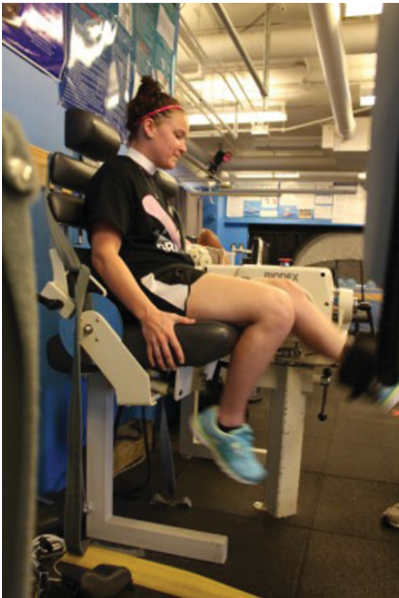
Fig. 5 Assessment of knee extensor strength using an isokinetic dynamometer.

waist strap, bilateral thigh straps, and a shin strap. The test was completed for each limb with at an angular velocity of 300^\circ/\text{second} for a total of 10 repetitions. Peak flexion and extension torques were recorded. Participants also completed a maximum vertical jump test. Participants were instructed to perform a standing maximum vertical jump to reach an overhead target for a total of three trials. The maximum jump height over the three trials was recorded.