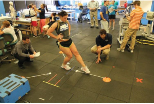
Fig. 4 Assessment of dynamic stability while performing the unilateral Y-Balance test.

waist strap, bilateral thigh straps, and a shin strap. The test was completed for each limb with at an angular velocity of 300^\circ/\text{second} for a total of 10 repetitions. Peak flexion and extension torques were recorded. Participants also completed a maximum vertical jump test. Participants were instructed to perform a standing maximum vertical jump to reach an overhead target for a total of three trials. The maximum jump height over the three trials was recorded.