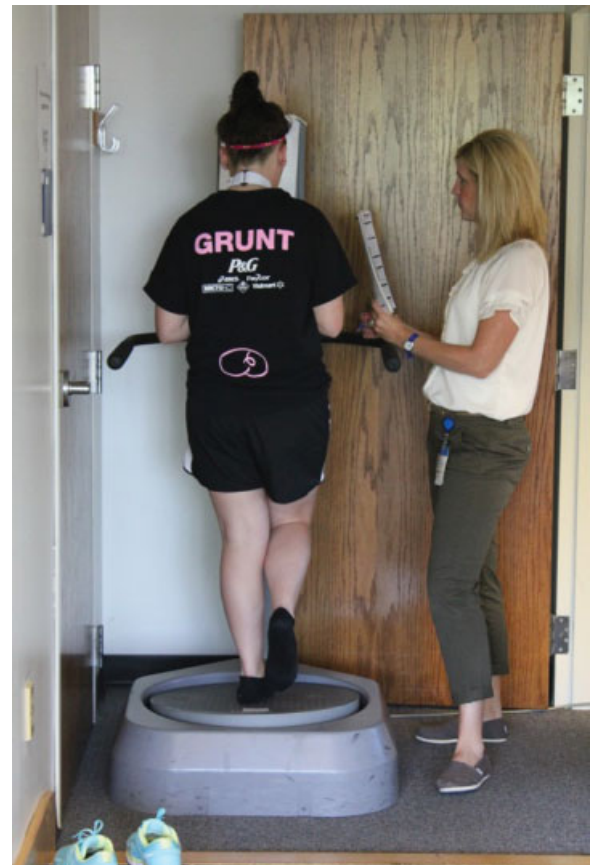
Fig. 3 Assessment of dynamic unilateral postural stability task using a stabilometer from which proprioception and coordination measures were calculated.

Knee flexor and extensor strength was measured using an isokinetic dynamometer (Biodex Medical Systems, Inc., Shirley, NY). Participants were seated on the dynamometer with their trunk perpendicular to the floor, their hip flexed to 90°, and their knee flexed to 90° (►Fig. 5). The athlete was instructed to push and pull against a padded buttress and a strap positioned just above the ankle by flexing and extending at the knee. Immobilization consisted of a thoracic strap, a