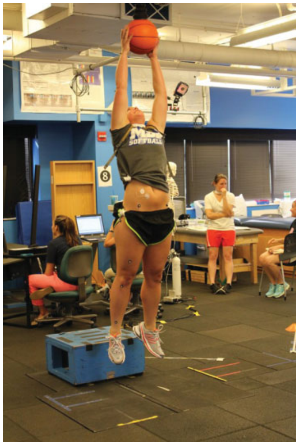
Fig. 2 The drop vertical jump task from which kinematic and kinetic measures were calculated during 3-D motion data capture. 3-D, three dimensional.

Dynamic, unilateral postural control was measured using a stabilometer (Biodex Medical Systems, Inc., Shirley, NY).